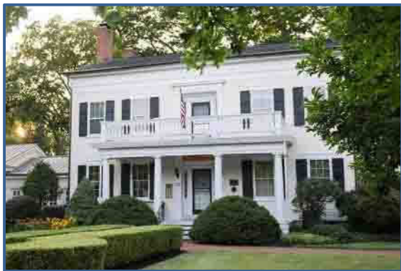
Auction Item: A stay at the historic Bykenhulle House