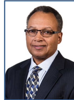
Jeffrey T. Sammons "Harlem's Rattlers and the Great War: The Undaunted 369 th Regiment and the Quest for African American Equality"