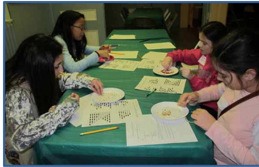
Left: The girls at work

For a rewarding experience, branch members can sign up to observe, join in interacting with the girls or participate in running the program. If interested contact Peggy Kelland, SMKell45@aol.com ■