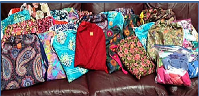
We sent 25 Days for Girls kits to Haiti via Vassar Haiti project in March 2018