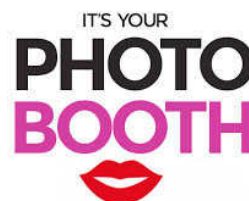
PHOTO BOOTH - ANNUAL MEETING

Have your photo taken with friends, colleagues, Interest Group members, etc. at the Annual meeting! Props will be provided.